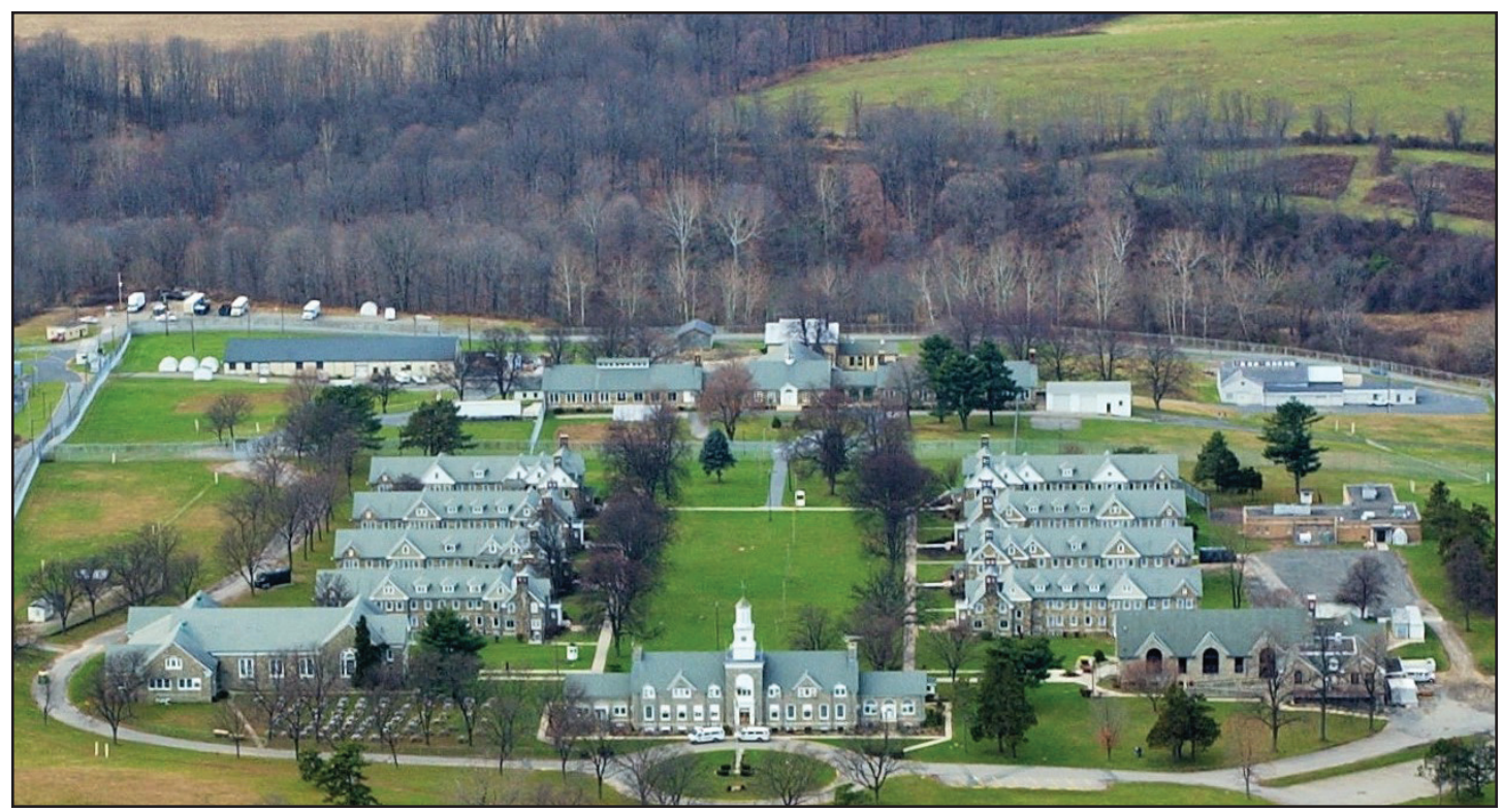
Mountainview Youth Correctional Facility, now William H. Fauver Correctional Facility, opened in 1929.