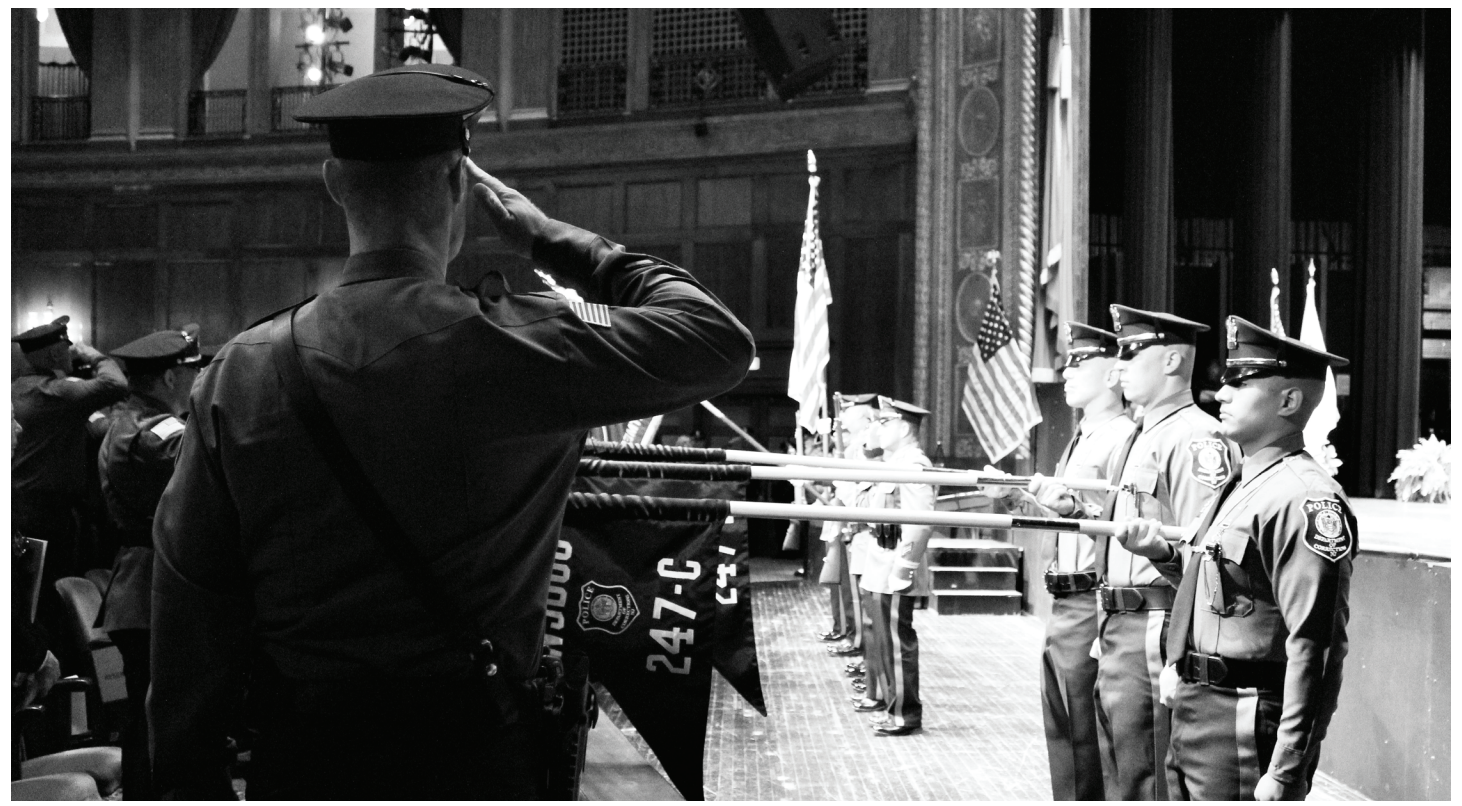
Employees at the NJDOC are aiming to prevent suicides by providing staff, both veteran and new, with specialized training designed to help manage the types of pressures often affecting members of the law enforcement community.